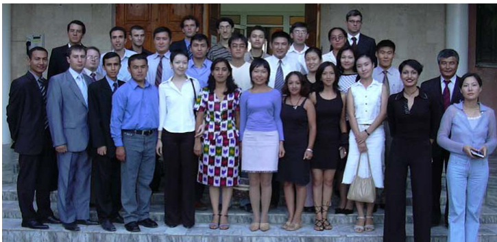
A new group of students for the new academic year at the OSCE Academy in Bishkek