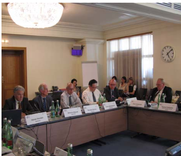
Discussing OSCE field activities

To contribute to discussions on direct activities of the OSCE in its participating States, the Centre for OSCE Research (CORE) and the German Federal Foreign Office jointly organized a workshop on "Developing OSCE Field Activities" at Vienna Hofburg, 26 and 27 May 2011.