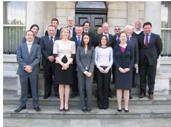
The participants of the Dublin CIO Training

ductions to specific security issues of various OSCE sub-regions.